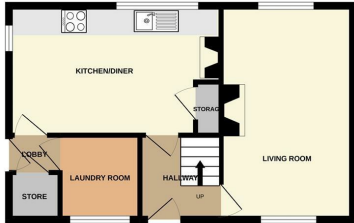
1ST FLOOR 412 sq.ft. (38.3 sq.m.) approx.